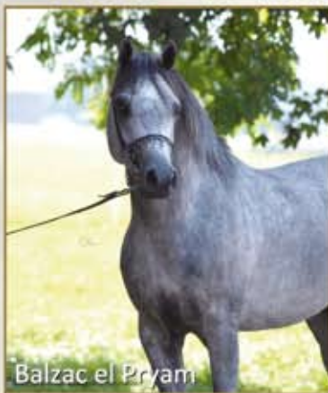
Balzac el Pryam