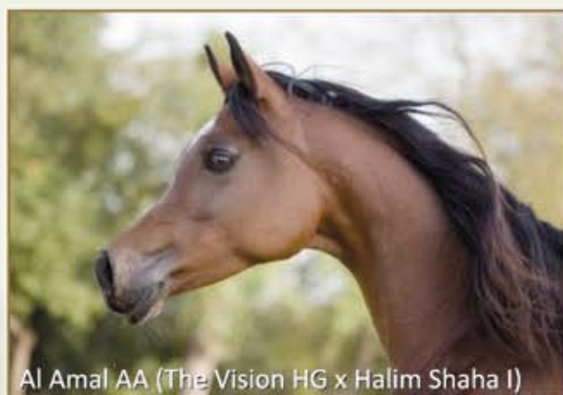
Al Amal AA (The Vision HG x Halim Shaha I)