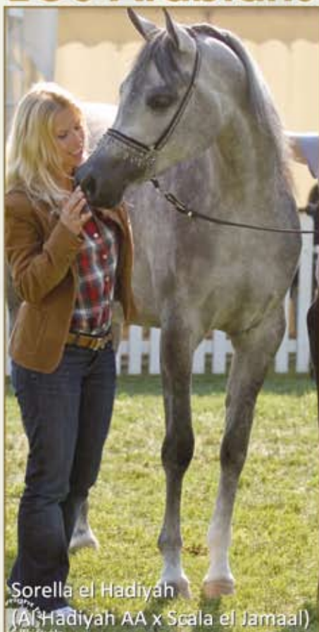
Sorella el Hadriyah (Al Hadriyah AA x Scala el Jamaal)