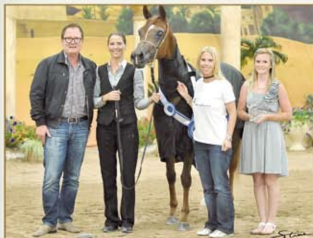
TF/Delfinia winning Most classic head at the Egyptian Event 2012

KH: I personally like showing. I like to visit shows, see friends and other horses. And I like to see my horses compared to others. Visiting shows is a good way to train the eye and to see what kind of horses are out there and where I have to improve. Breeding means being self critical all the time.