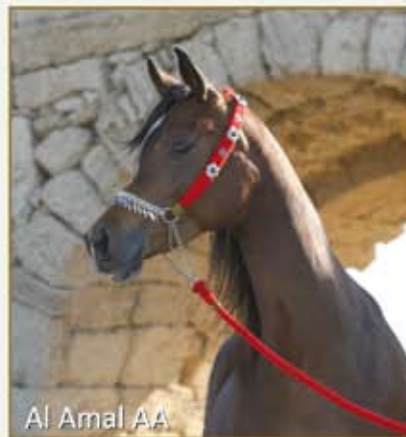
Al Amal AA

lot of time and patience in finding my mares. To find your mares, the most important base of your future breeding program, you really have to be out there and look for them. It takes time and money to acquire what you think is the best mare for you - but in the end it will be worth it. The key word here is breeding: I want to breed horses, not just produce horse after horse.