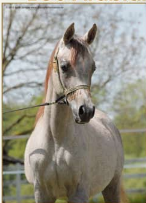
Umai el Adeed (Al Adeed al Shaqab x Luiba)