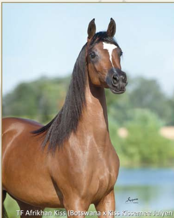
TF Afrikhan Kiss (Botswana x Kiss Kissemee Julyen)