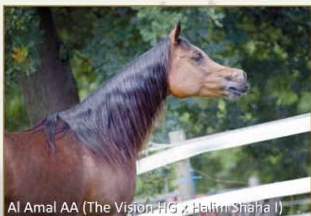
Al Amal AA (The Vision HG x Halim Shaha I)