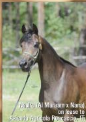
Yasira (Al Maraam x Nana) on lease to Azienda Agricola Roncaccio, IT