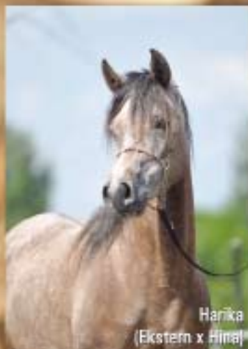
Harika (Ekstern x Hina)