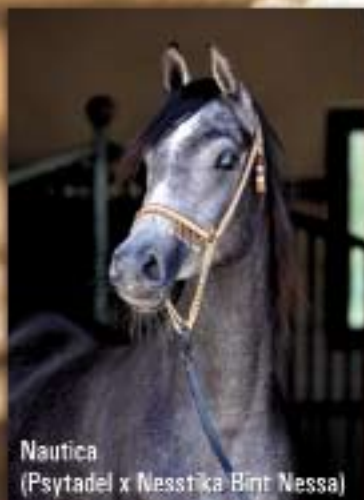
Nautica (Psytadel x Nesst'ka Bint Nessa)