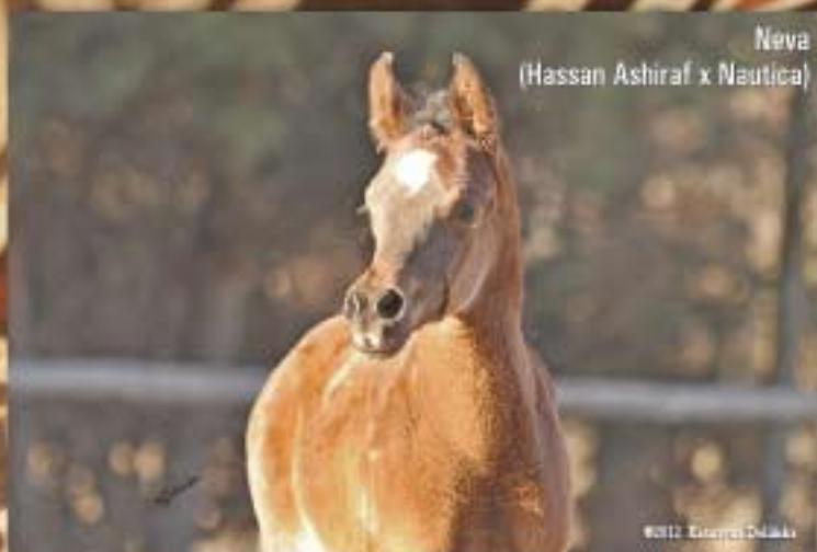
Neva (Hassan Ashiraf x Nautica)