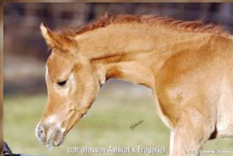
colt (Hassan Ashiraf x Fragaria)