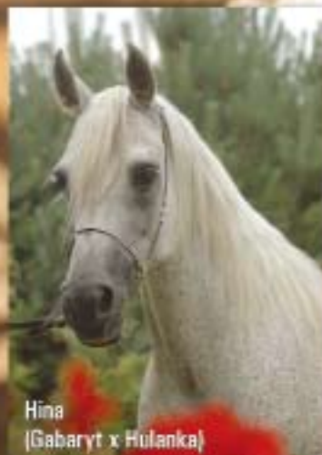
Hina (Gabaryt x Hulanka)