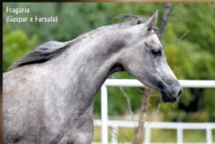
Fragaria (Gaspar x Farsala)