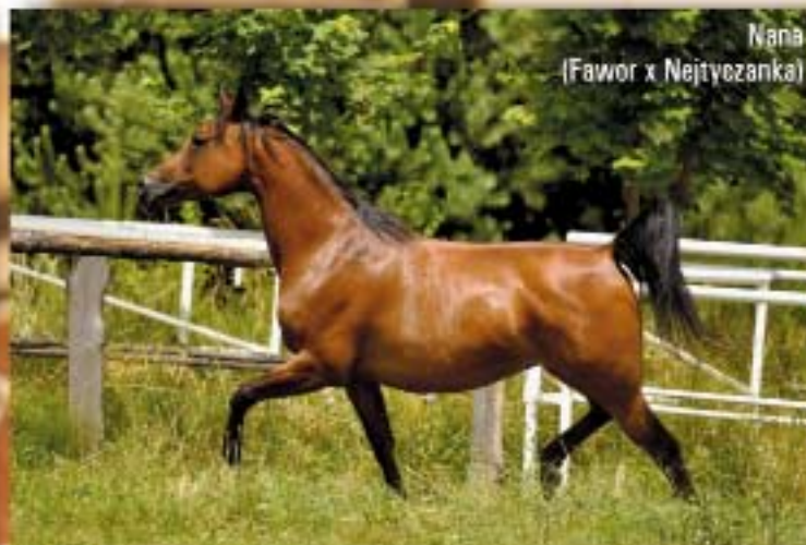
Nana (Fawor x Nejtyezanka)