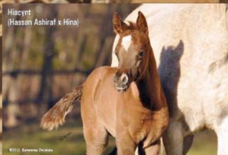
Hiacynt (Hassan Ashiraf x Hina)

by Ekstern produced their excellent foals and Halala by Al Maraam, as well as two mares from this line sold abroad – Hawanah by Etnodrons Psyche in Romania and Hanah by Poganin – in Iranu are also awaiting Hassan foals. Interesting is that comparing the foals out of Russian blood mares – as out Nautica, granddaughter of Gips, and out of pure Polish mares I can say that since Hassan foals out of Russian blood are better then their dams but those foals out of Pure Polish mares are very much sire-like. I hope this will also be a clue for other breeders who plan to use Hassan – to try him on Polish mares!