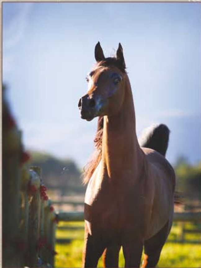
EKS ALIHANDRO (MARWAN AL SHAQAB X OFW PSYLOUETTE)

Probably the next wonder horse to hit Europe is soon to be exported EKS ALIHANDRO (Marwan Al Shaqab x OFW Psyhouette by Padrans Psyche.) This bay colt is tall, elegant and refined. He has a superbly sprung neck, a wonderful shoulder, good legs – he moves like a train and has tail carriage in abundance. Coupled with big eyes, a supremely dished face and a slightly feminine quality which guarantees that he will always retain his incredible refinement, this young colt is certainly a class act.