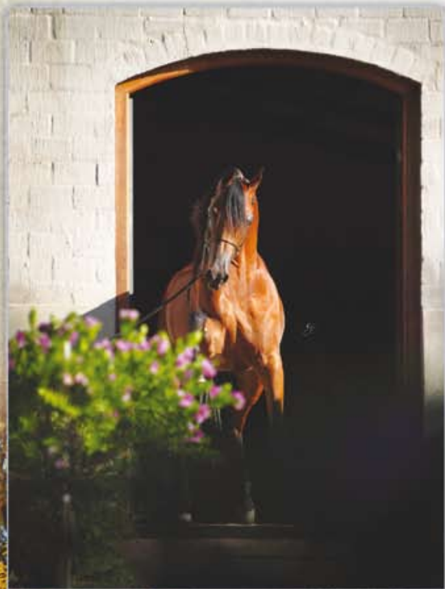
MONTSERRAT RTA, 2009 COLT (BESSON CAROL X JAMAICA JULLYEN PGA)