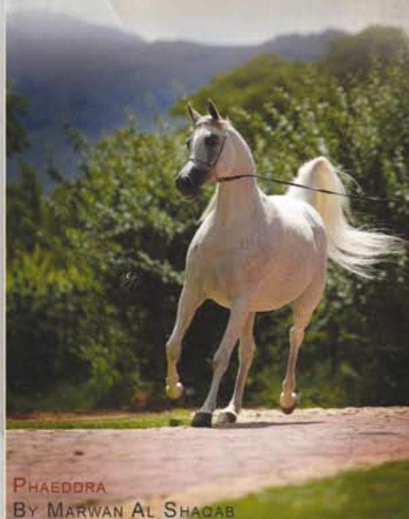
PHAEDDRA BY MARWAN AL SHAQAB

The lovely grey colt ABHA QEBEC has been well used at stud in South Africa and in Namibia. In addition to this he has garnered a series of big halter championship wins including Res. National Junior Champion Stallion 2010. His biddable temperament, beautiful paces and soft mouth suggest that Willie is quite right to expect him to make a serious ridden show horse. Qebec perfectly illustrates that Willie's horses may be exceedingly typey but they are also required to prove their good temperament and athletic ability.