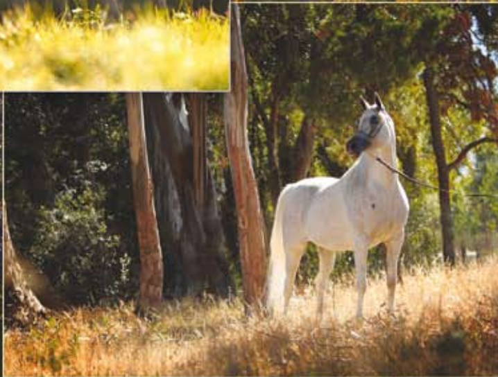
TOP LEFT & PICTURED OPPOSITE PAGE: EKS SHAKIRA (SHAKIR EL MARWAN X POETICA B) ABOVE: EKS ANTIGUA (WN STAR OF ANTIGUA X BINT STARBRIGHT BEY) BOTTOM LEFT: PHAEDDRA (MARWAN AL SHAQAB X PATRINAS DE PARIS)