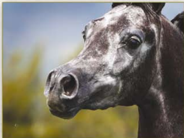
EKS LATHINA (WN STAR OF ANTIGUA X KAR HADI)