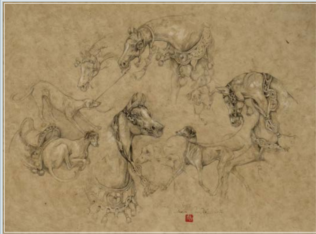
"Horses and Sloughis".