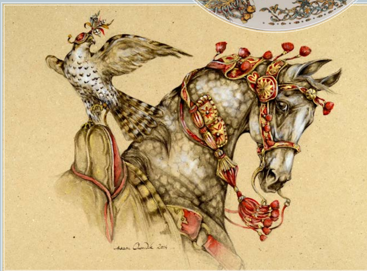
"The Falcon" by Marine Oussedik.