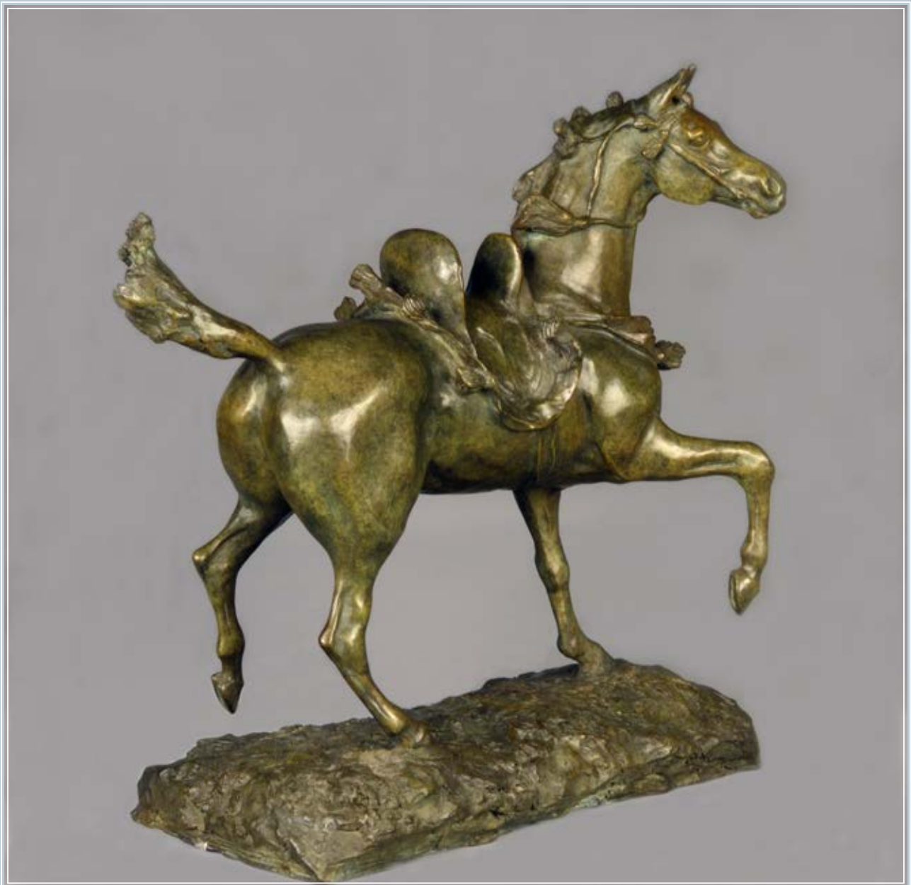
"Le Vent" ("The Wind"), an imposing sculpture by Marine Oussedik.

Head Trophy. Asked if she has a favorite Arabian horse, Marine Oussedik quickly responds: "No, I love them all. I like the 'old type' from the Arabian Desert as much as the horses you see at shows nowadays."