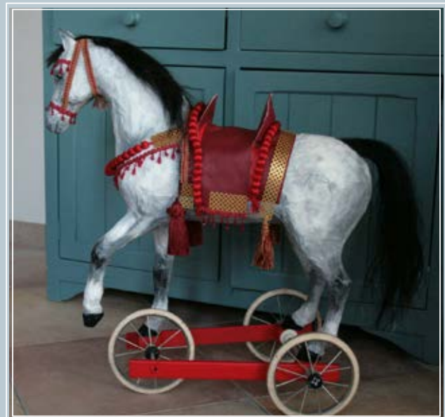
Charming Arabian rocking horse designed by Marine Oussedik.