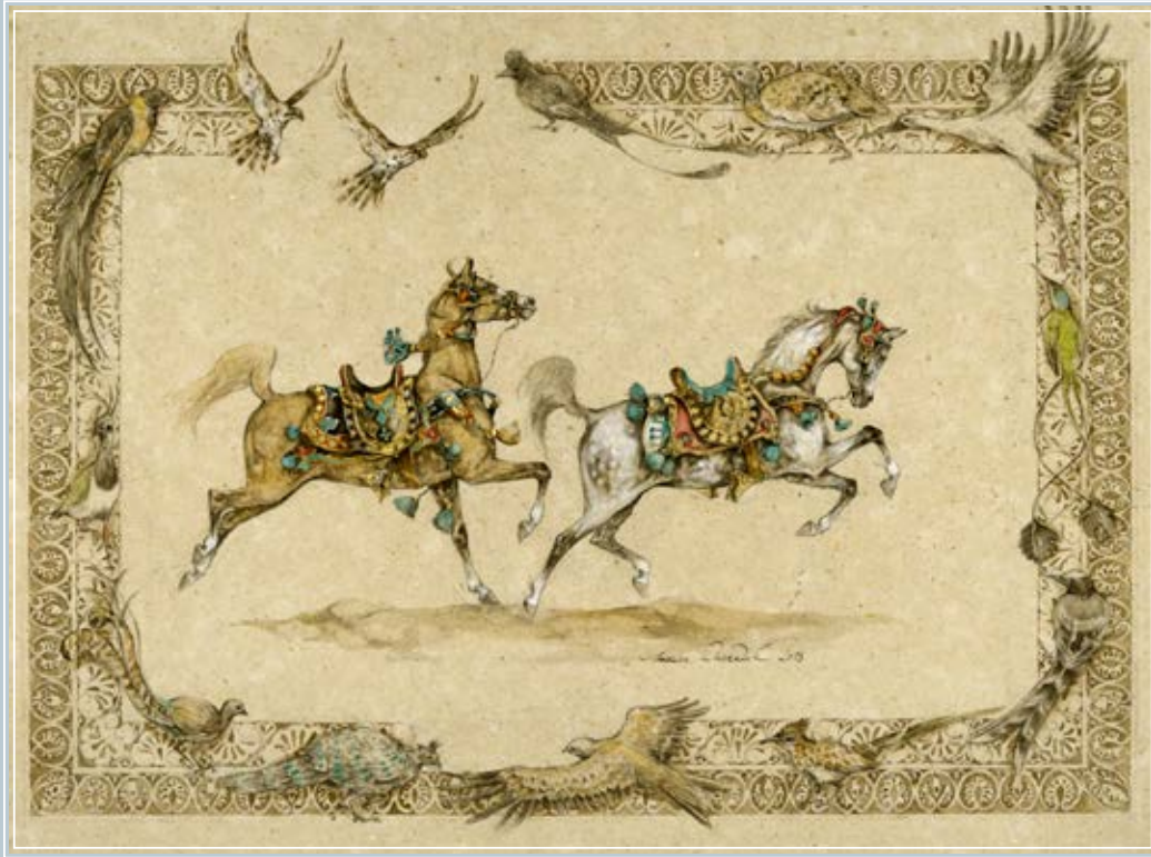
"The Birds", beautifully colored painting by Marine Oussedik.