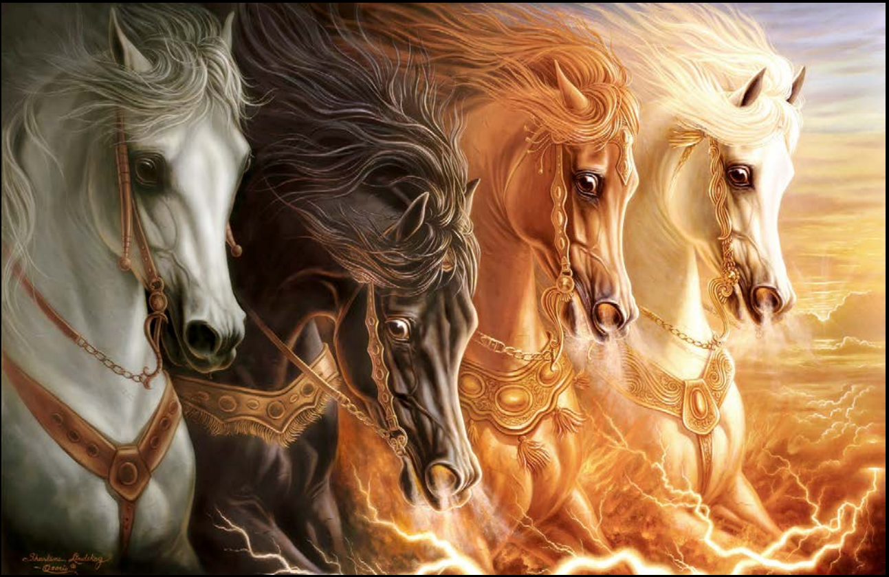
The Four Horses of the Apocalypse