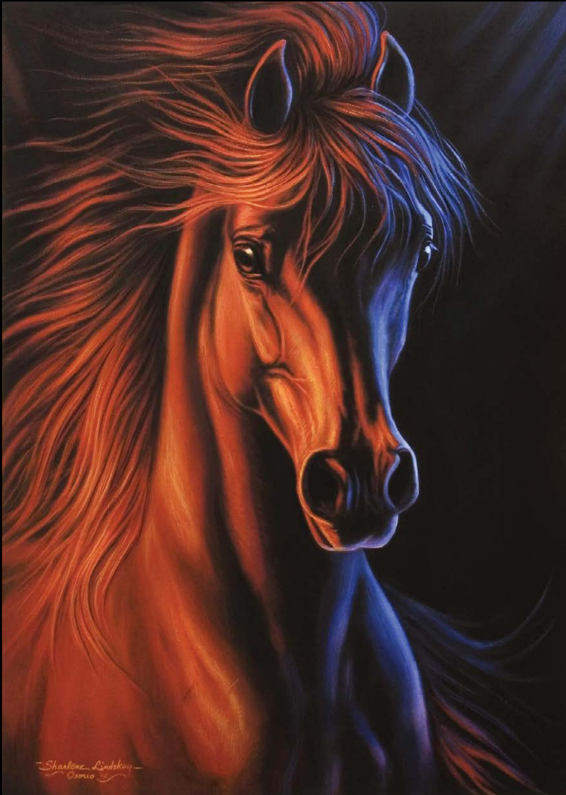
Fire and Ice