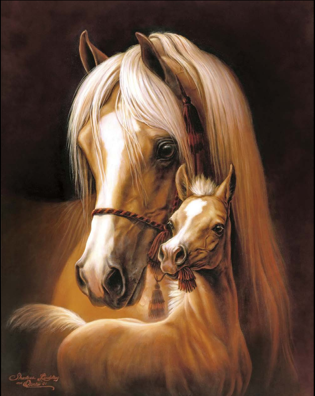
Mommy and Me