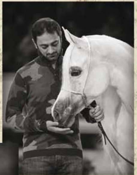
HH Sheikh Amaar Bin Humaid Al Numaimi & "Bess Fa'izah" Arabian World Championships Paris, France