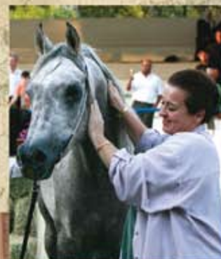
Pictured above: HRH Princess Alia Bint Al Hussein Al Saleh with her lovely stallion "Al Arabi"