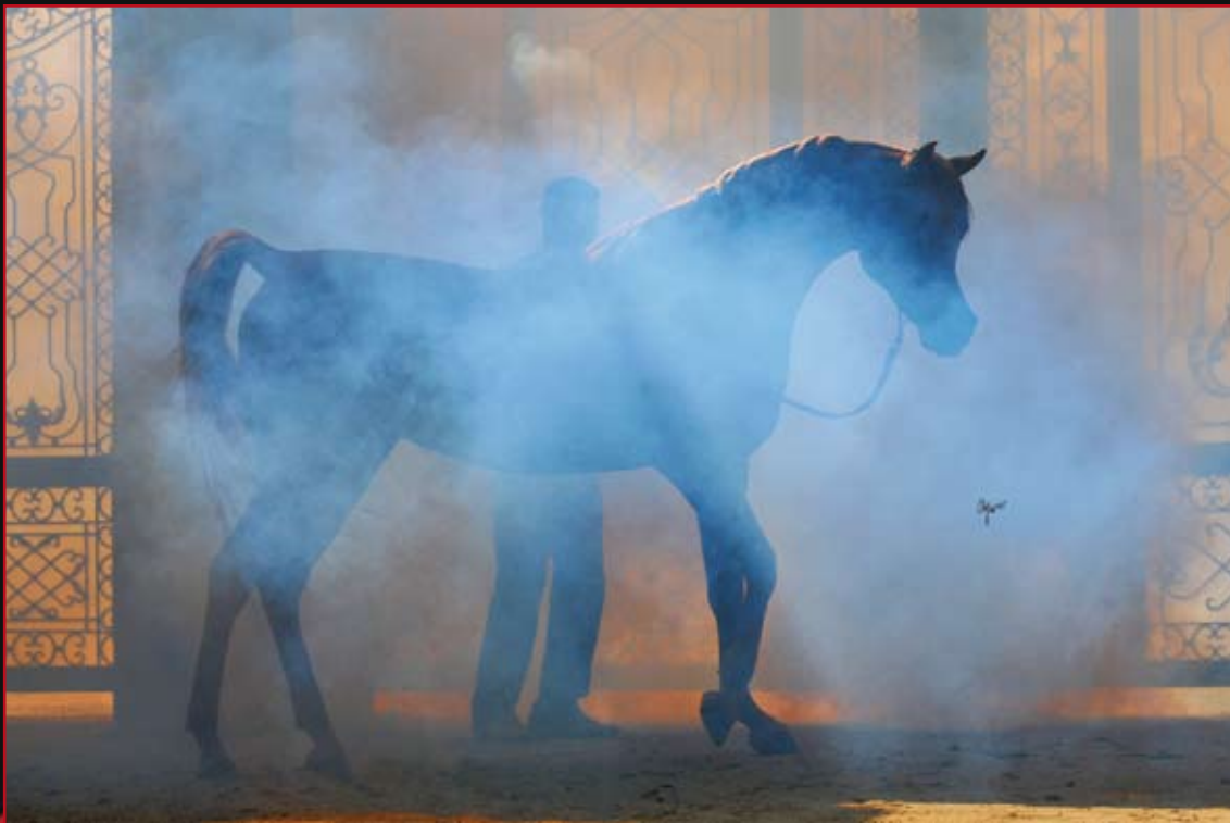
ARIF AL KHALED - OWNED BY AL BAWADY STUD / EGYPT