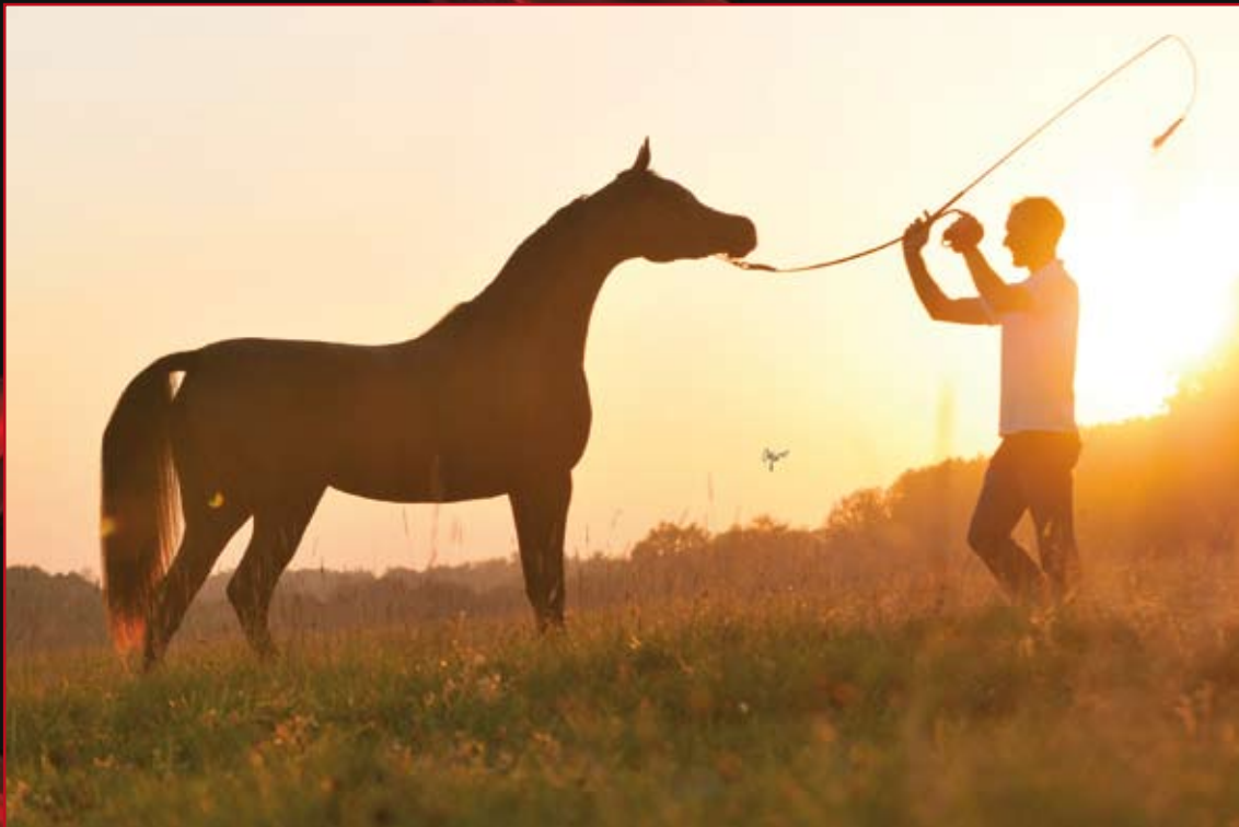
MIRWANAH KALLISTE - OWNED BY KALLISTE ARABIANS / FRANCE