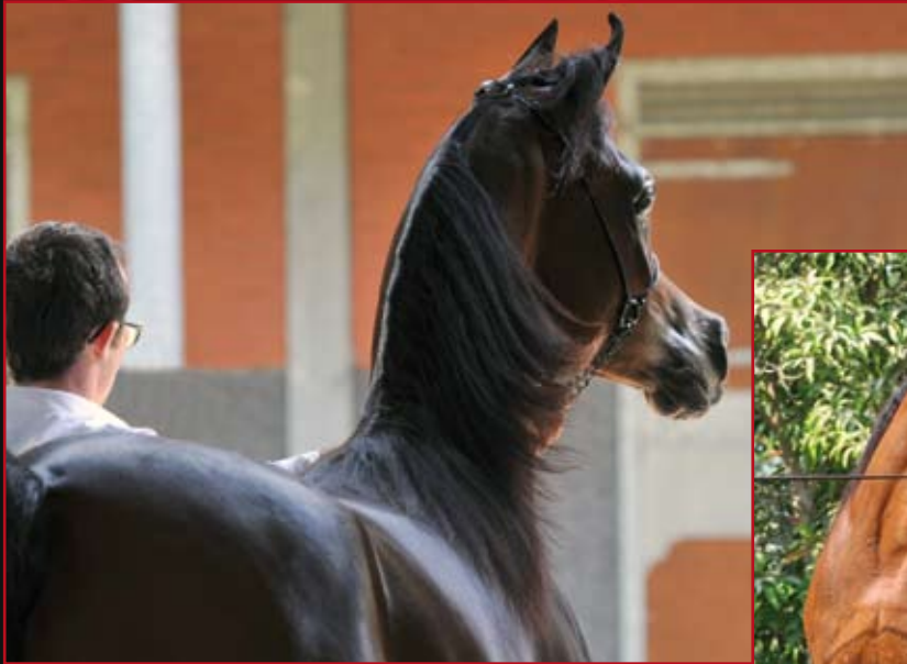
EMERALD J - OWNED BY AL JALAWIYAH STUD / KSA