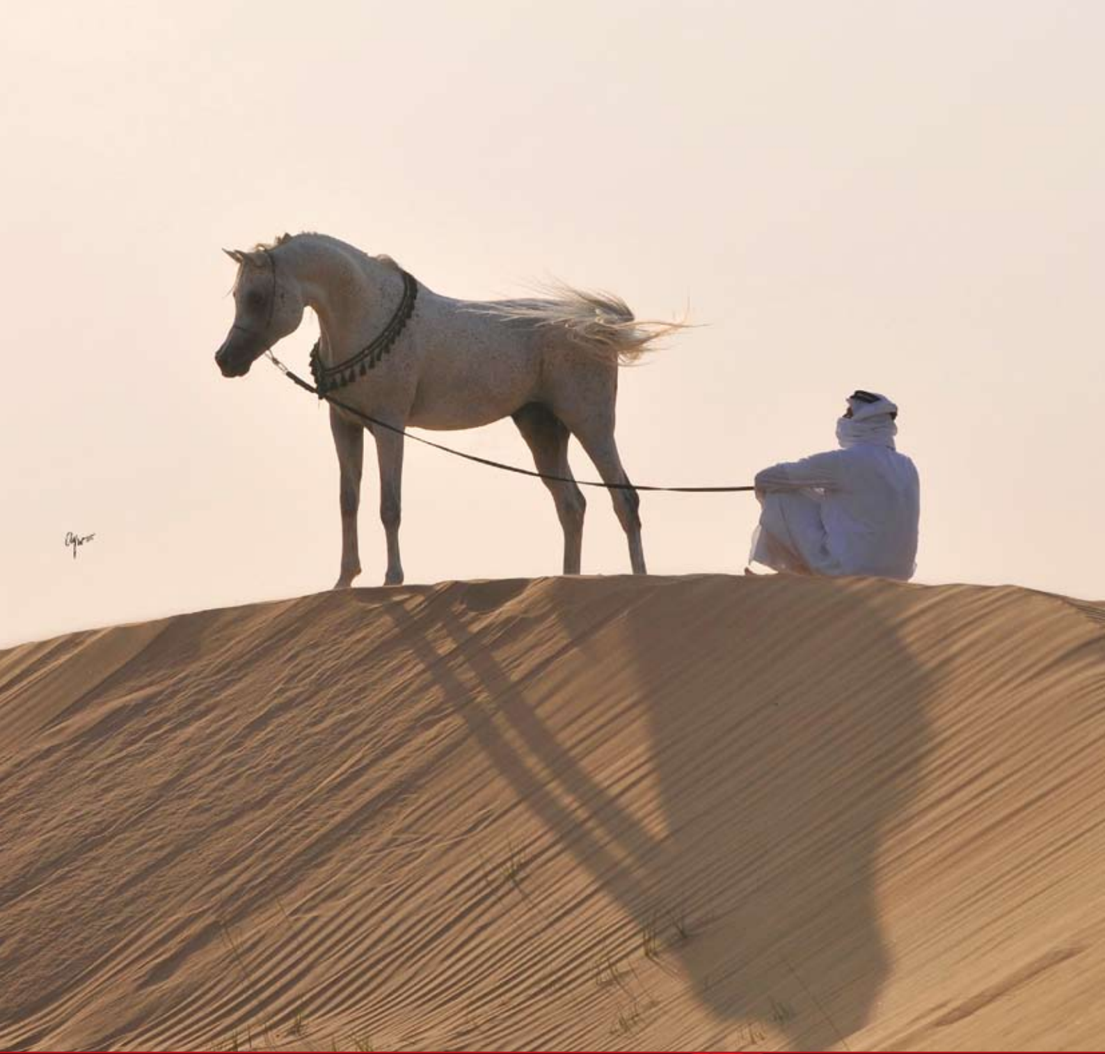
ASHOUR - OWNED BY THE DUBAI ARABIAN STUD / UAE