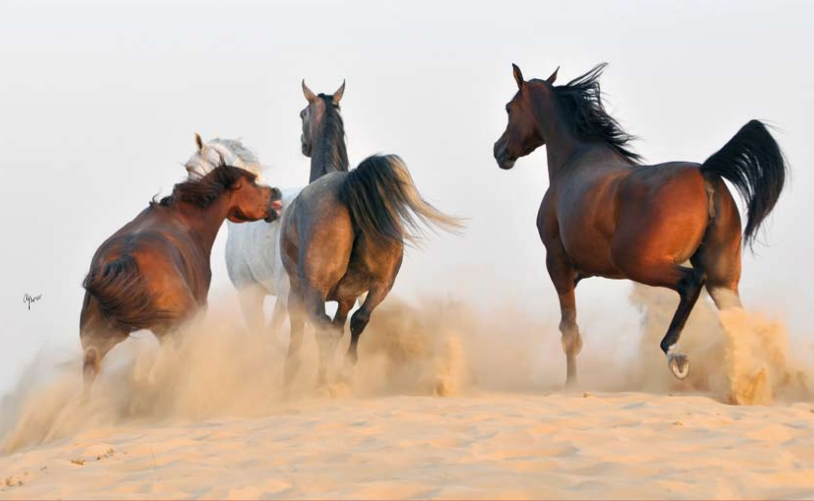
GROUP OF MARES IN THE DESERT