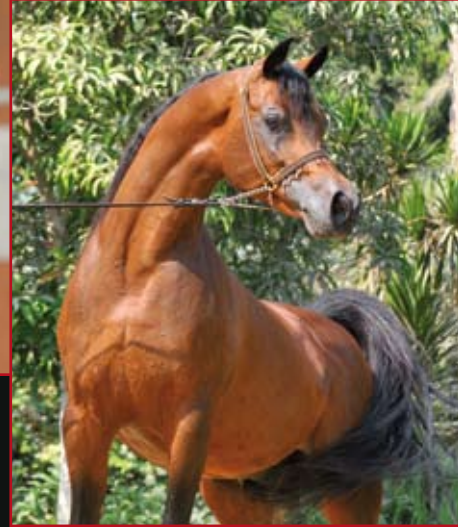
KENZ NOOR OWNED BY RABAB STUD / EGYPT