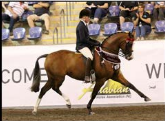
Shiranna Ridden Sash Winner (for Arabian Derivatives 50% or more) 'World Class MI' Owner MULAWA ARABIANSTUD