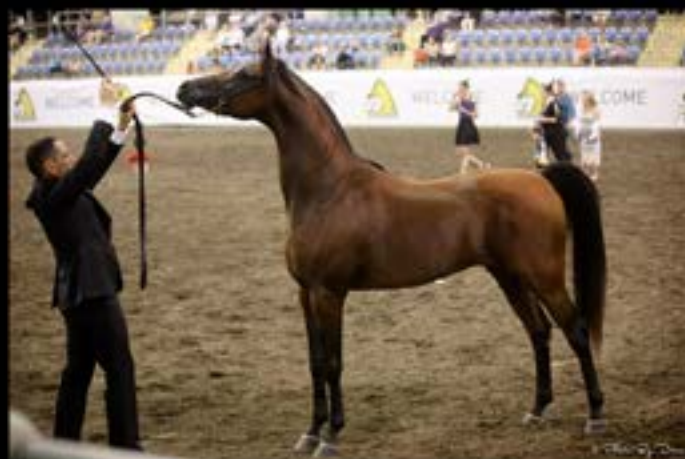
WINNER ARABIAN COLT 3 YEARS 'KAVALIER MI' Owner MULAWA ARABIAN STUD