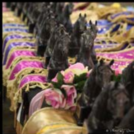
'WINDELLA SILVER GLEAM' AnneVella