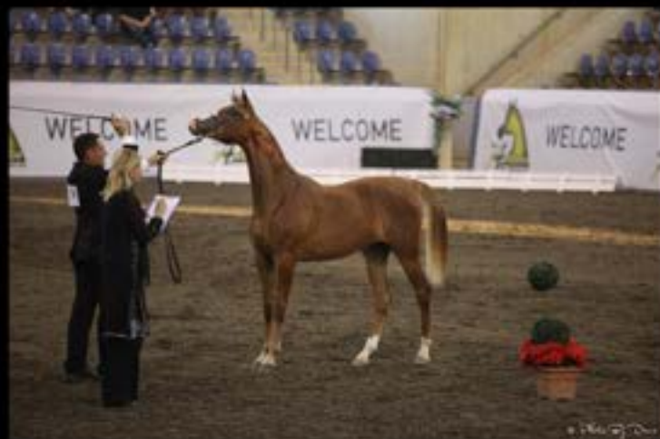
WINNER OF YEARLING FILLY