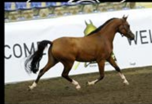
Derivative Liberty n.e 144h - Tiara FF