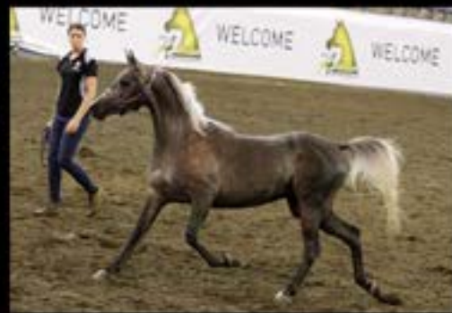
Purebred Liberty winner - Imagine MI