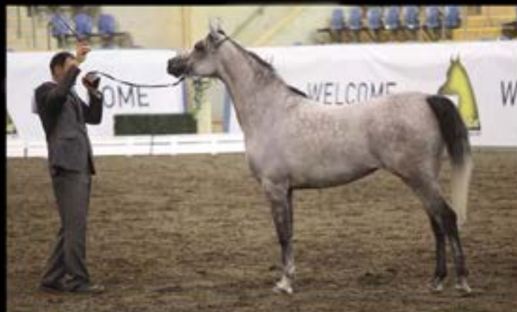
WINNER MARE 4, 5 & 6 YEARS