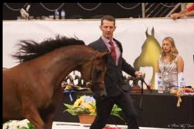
WINNER ARABIAN COLT 2 YEARS 'ECHOS OF TOMORROW' - Owner BRAVEHEART ARABIANS