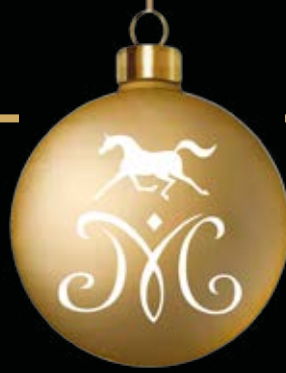
Stadnina Koni Michałów